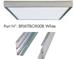
Part N°: BPLKITBOX00B White