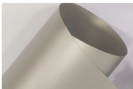
PVC GOLDEN OLIVE 587