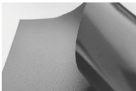
PVC ALFAPLAS BLACK