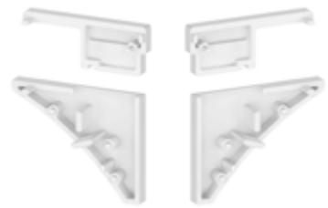
plastic end caps P10-1